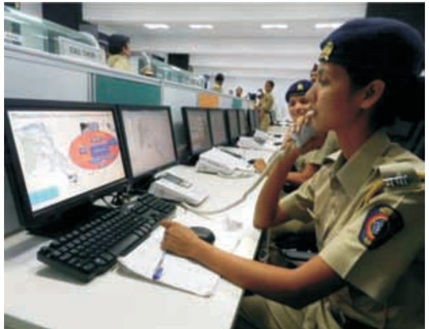
Maharashtra Police Control Room